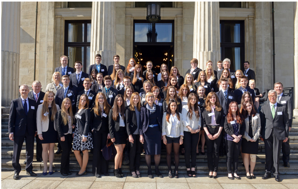
Welcome of the scholars at Villa Hügel, after having finished the four weeks practical training period.

On this basis, 50 pupils from schools in Essen have the opportunity to get to know the requirements for their future profession and to be prepared for their career.